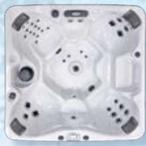
CANCUN X EC-840BX / EC-867BX 40 jets / 67 jets 8 ft. bench, 6 seats 93"W x 93"L x 40'/2"H