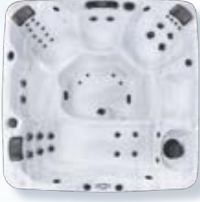
AVALON EC-840L / EC-867L 40 jets / 67 jets 8 ft. lounger, 6 seats 93"W x 93"L x 401/2"H