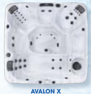
EC-840LX / EC-867LX 40 jets / 67 jets 8 ft. lounger, 6 seats 93"W x 93"L x 401/2"H