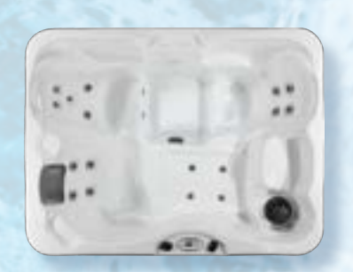
KONA PZ-519L 19 jets 5 ft. lounger, 3 seats 64"W x 84"L x 34"H

The Patio<sup>TM</sup> spas are designed to compliment any patio while a 2.0 BHP pump exudes an inviting hydrotherapy experience that both couples and families can enjoy. Additionally, our Patio<sup>TM</sup>, plug & play 110v, spas are designed to be set up quickly so that you can start enjoying your spa faster. Share the ultimate hot tub experience with loved ones in an intimate Patio<sup>TM</sup> spa.