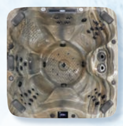
LAGUNA PL-793B 93 iets 7 ft. bench, 6 seats 84"W x 84"L x 401/2"H