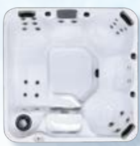
HAWAIIAN PLUS PPZ-628L / PPZ-634L 28 jets / 34 jets 6 ft. lounger, 5 seats 78"W x 78"L x 34"H