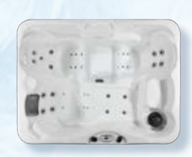
KONA PZ-535L 35 jets 5 fl. lounger, 3 seats 64"W x 84"L x 34"H