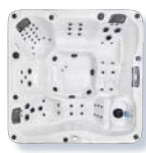
MALIBU X EC-867DLX 67 jets 8 ff. dual lounger, 5 seats 93"W x 93"L x 40<sup>1</sup>/<sub>2</sub>"H