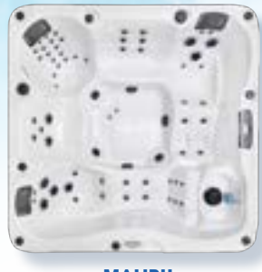
MALIBU EC-867DL 67 jets 8 ft. dual lounger, 5 seats 93"W x 93"L x 401/2"H