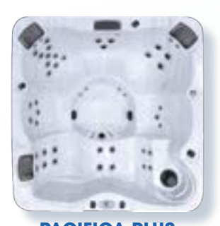
PACIFICA PLUS PPZ-743L / PPZ-752L / PPZ-759L 43 jets / 52 jets / 59 jets 7 ft. lounger, 6 seats 84"W x 84"L x 37"H