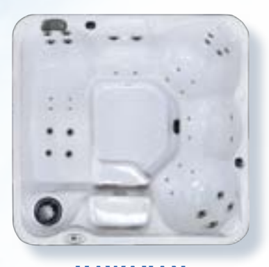
PZ-636L 36 jets 6 ft. lounger, 5 seats 78"W x 78"L x 34"H