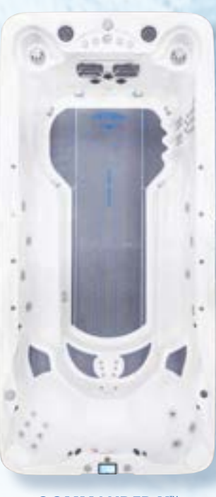
COMMANDER XT F-1655X