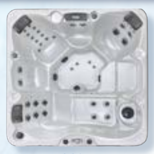
COSTA EC-749L / EC-749L / EC-767L 40 jets / 49 jets / 67 jets 7 ft. lounger, 6 seats 84"W x 84"L x 40"/<sub>3</sub>"H