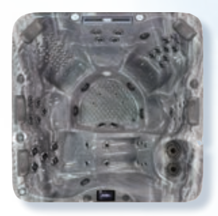
HUNTINGTON PL-792L 92 jets 7 ft. lounger, 6 seats 84"W x 84"L x 401/2"H

The Platinum™ Series is one of our most powerful spa series with luxurious features that comes standard like the Adjustable Therapy System™, 2 and 3 pump configurations, 24/7 circulation pump, Hybrid Clear Water System and 150 sq. ff. Bio Clean Filters<sup>TM</sup> which provides clearer, cleaner water while lowering maintenance.