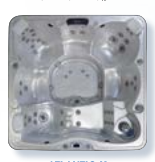
ATLANTIC X EC-851LX 51 jets 8 ft. lounger, 6 seats 93"W x 93"L x 401/2"H