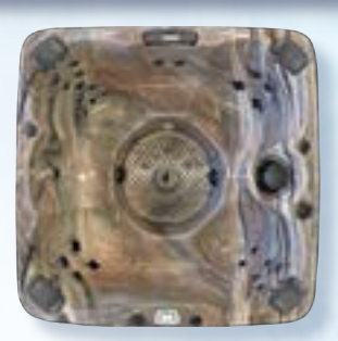
TROPICAL X EC-739BX / EC-751BX 39 jets / 51 jets 7 ft. bench, 6 seats 84"W x 84"L x 401/2"H