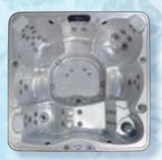
ATLANTIC EC-851L 51 jets 8 ff. lounger, 6 seats 93"W x 93"L x 401/2"H