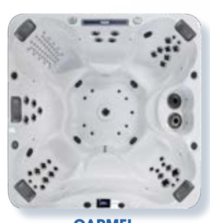
CARMEL PL-893B 93 iets 8 ft. bench, 6 seats 93"W x 93"L x 40<sup>1</sup>/<sub>2</sub>"H