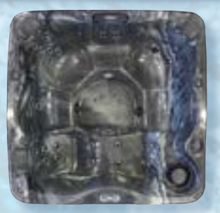
PACIFICA EC-739L / EC-751L 39 jets / 51 jets 7 ft. lounger, 6 seats 84"W x 84"L x 401/2"H

More than just a home spa — an Escape Spa is a ticket to paradise! Easily adjustable controls and the latest in hydrotherapy design allow for the perfect vacation package right at home. Escape from the day's stresses anytime you please when you step into one of the 9+ options we have in our Escape lineup.