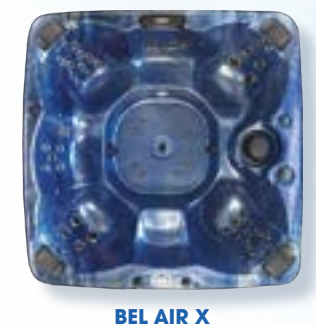
EC-851BX 51 jets 8 ft. bench, 6 seats 93"W x 93"L x 401/2"H