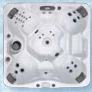
BAJA X EC-740BX / EC-749BX / EC-767BX 40 jets / 49 jets / 67 jets 7 ft. bench, 6 seats 84"W x 84"L x 40/6"H