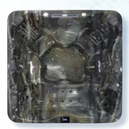
LA JOLLA PL-894L 94 iets 8 ft. lounger, 6 seats 93"W x 93"L x 40<sup>1</sup>/<sub>2</sub>"H