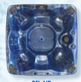
BEL AIR EC-851B 51 jets 8 ff. bench, 6 seats 93"W x 93"L x 401/2"H