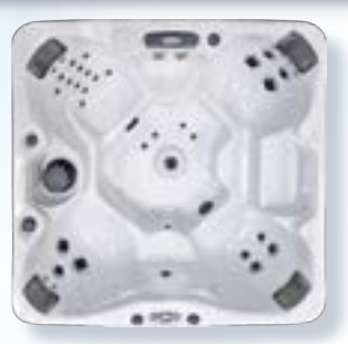
BAJA EC-740B / EC-749B / EC-767B 40 jets / 49 jets / 67 jets 7 ft. bench, 6 seats 84"W x 84"L x 40'/;"H