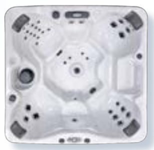
CANCUN EC-840B / EC-867B 40 jets / 67 jets 8 ft. bench, 6 seats 93"W x 93"L x 401/2"H