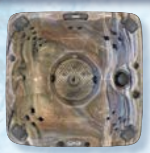
TROPICAL EC-739B / EC-751B 39 jets / 51 jets 7 ft. bench, 6 seats 84"W x 84"L x 401/;"H