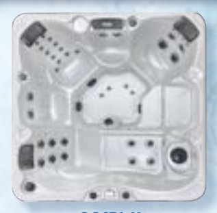
COSTA X EC-740LX / EC-749LX / EC-767LX 40 jets / 49 jets / 67 jets 7 ft. lounger, 6 seafts 84"W x 84"L x 401/2"H