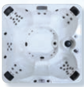
BEL AIR PLUS PPZ-843B / PPZ-859B 43 jets / 59 jets 8 ft. bench, 6 seats 93"W x 93"L x 37"H