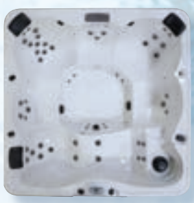
ATLANTIC PLUS PPZ-843L / PPZ-859L 43 jets / 59 jets 8 ft. lounger, 6 seats 93"W x 93"L x 37"H