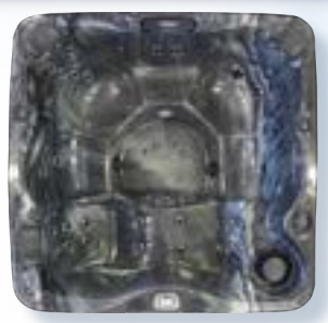
PACIFICA X EC-739LX / EC-751LX 39 jets / 51 jets 7 ft. lounger, 6 seats 84"W x 84" | x 401/6"H

Let us show you the real meaning of Escape with our new Escape-X series spas, where premium features are a standard! This includes a 3 pump system, and upgraded premium finish cabinets with the look and feel of natural wood on the exterior. Sure as Zen appeal!