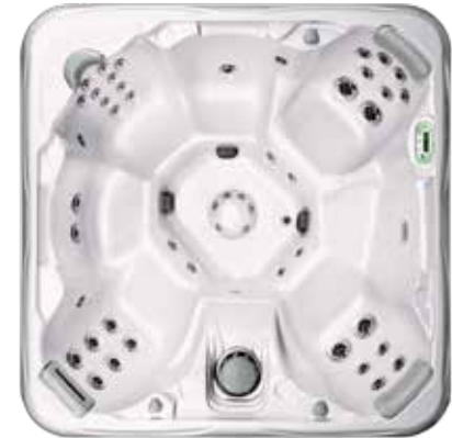
LUSTER**, White Pearl+