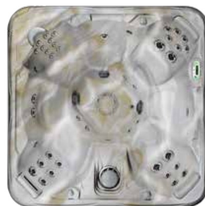
LUSTER SWIRL**, Smoky Mountains+