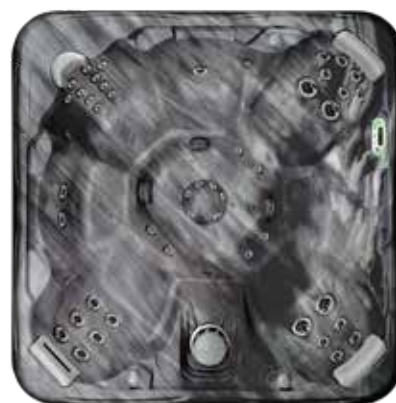
LUSTER SWIRL**, Storm Clouds