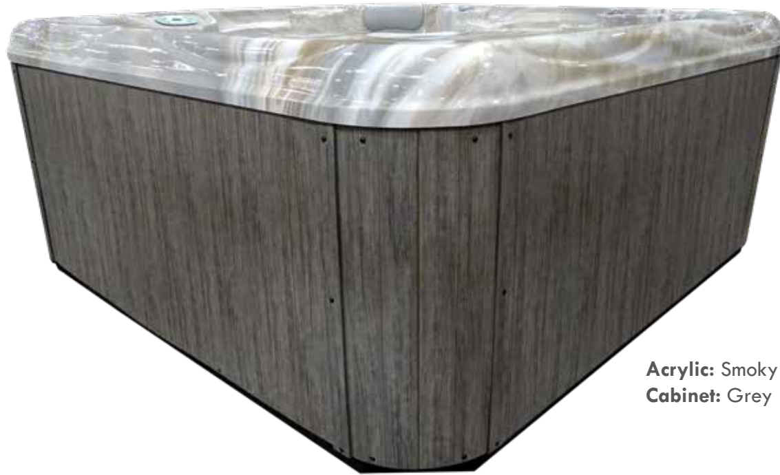
Acrylic: Smoky Mountains Cabinet: Grey

From the realistic wood-like texture to the matte finish, it's no wonder these cabinets are called Grandwood. They feature a tight grain pattern along with subtly varying shades of color. This subtle variance creates a more realistic look and feel of natural wood.