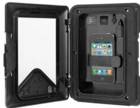
Aquatic Media Locker