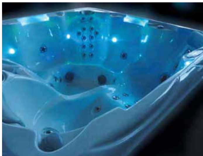
DynaStar LED Lighting