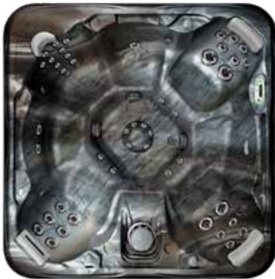
LUSTER SWIRL**, Midnight Canyon+

**Upgrade Colors | +965L Deluxe Available Color