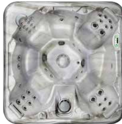
METALLIX**, Glacier Mountain+