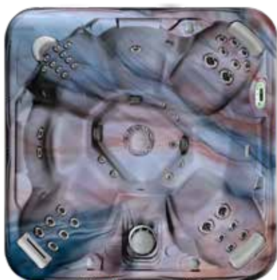
LUSTER SWIRL**, Tuscan Sun+