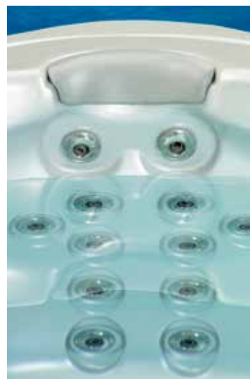
Stainless Steel Jets