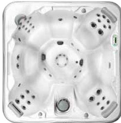
MARBLE, Silver Marble+